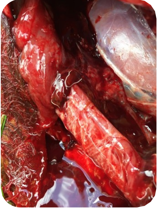
Lungworm PM diagnosis in Autumn grazed