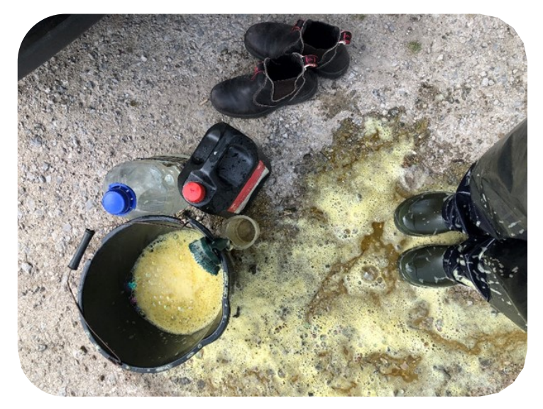
Disinfection is just one of the many things that came be done to increase biosecurity on farm

If you're interested in a TBAS visit, even if you have done so in the previous round of funding, please contact the practice (all risk areas now eligible).